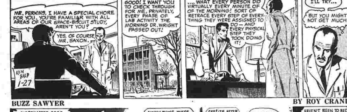
BY ROY CRANE