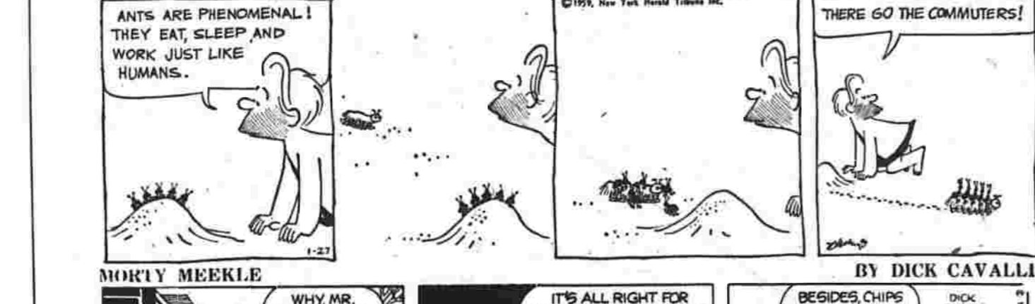
BY DICK CAVALL