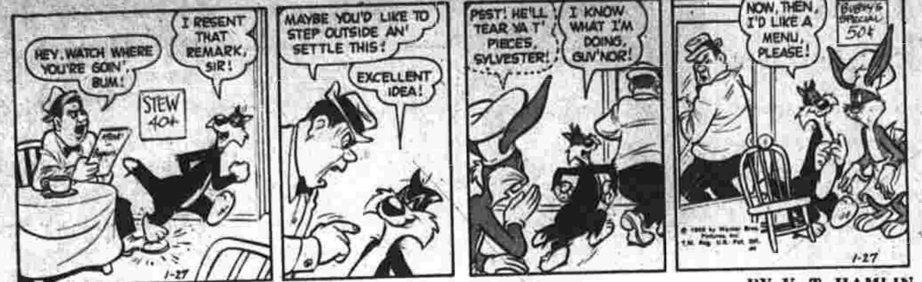
BY V. T. HAMLIN