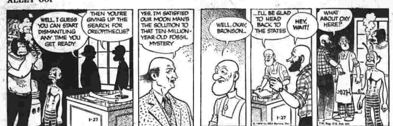
BY AL VERMEER