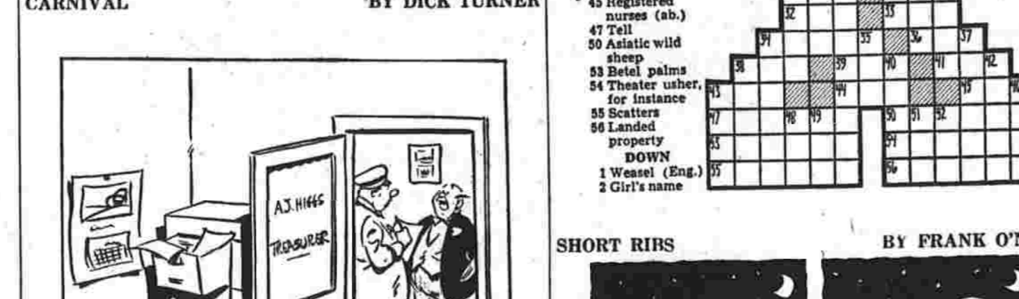
BY DICK TURNER