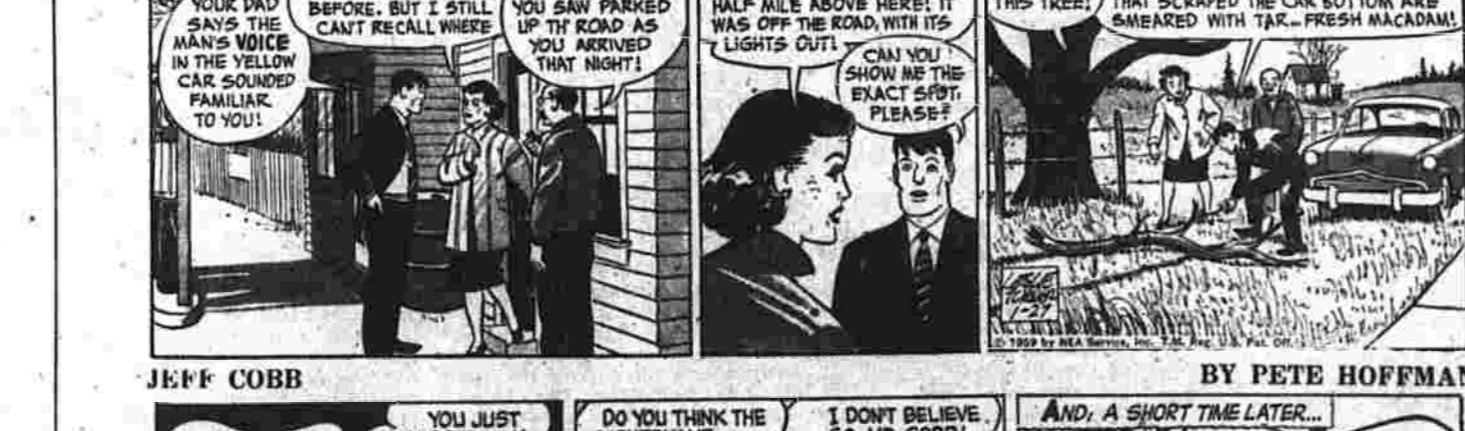
BY PETE HOFFMAN