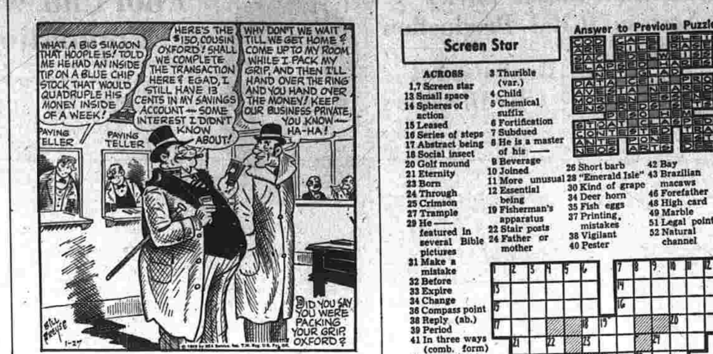
BY DICK TURNER