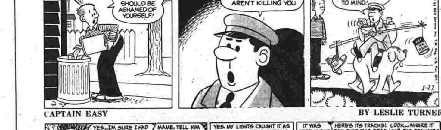
BY LESLIE TURNER